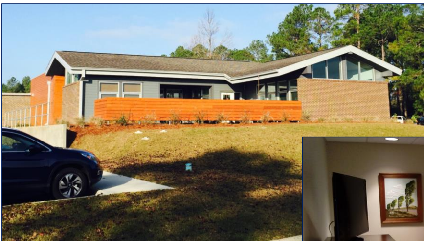
The Rehab Inn

December Spotlight... Construction Progress