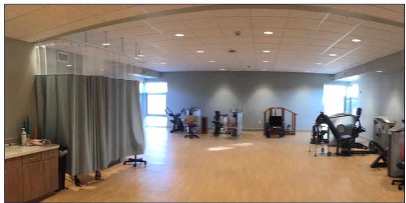
New Therapy Gym

I look forward to sharing with you again next month as our journey continues. Thank you for your continued support of Wesley Place on Honeysuckle.