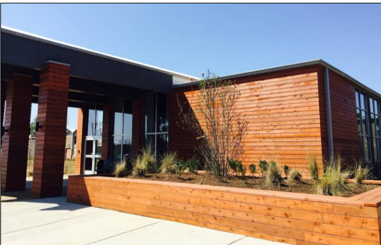
Modern 'wood rain screen' complete along front entrance. New planter to burst with spring color soon.

I look forward to seeing everyone on April 27, in just over a month's time, for our Ribbon-Cutting and Dedication Celebration. Thank you for your continued support of Wesley Place on Honeysuckle.